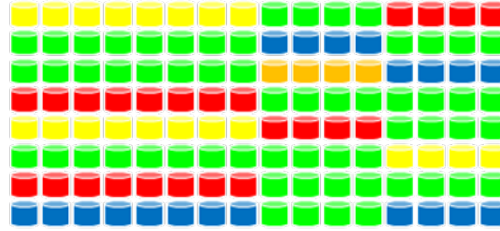
Traditional RAID: Mix of hot and cold drive-based RAID groups, fluctuating over time.